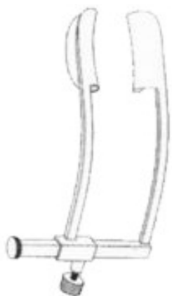
22-380-03 Sauer Eye Specula, 3 cm