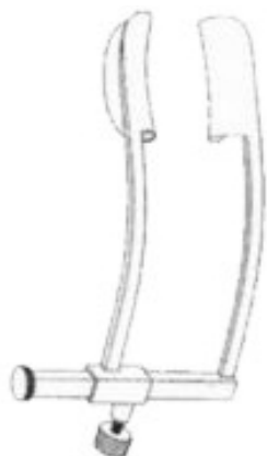
22-379-03 Cook Eye Specula, new born