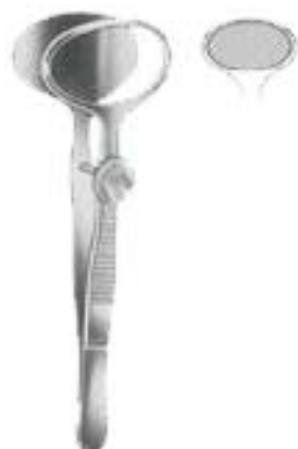
22-710-01 Desmarres chalazion forceps, Fig. 1