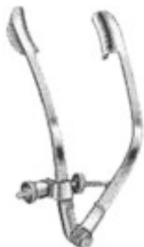
22-374-00 Lancaster Eye Specula, 8 cm